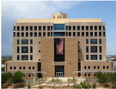
Pete V. Domenici Courthouse, Albuquerque