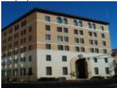
U.S. Historic Courthouse, Albuquerque