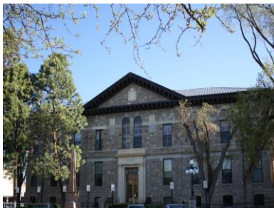
Santiago E. Campos Courthouse, Santa Fe