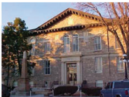
Santiago E. Campos Courthouse, Santa Fe