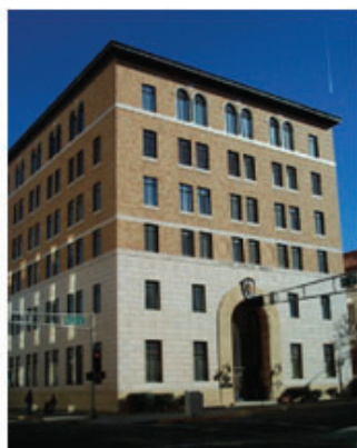
U.S. Historic Courthouse, Albuquerque