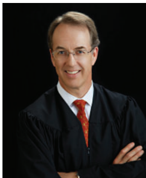
The Hon. John Robbenhaar, U.S. Magistrate Judge