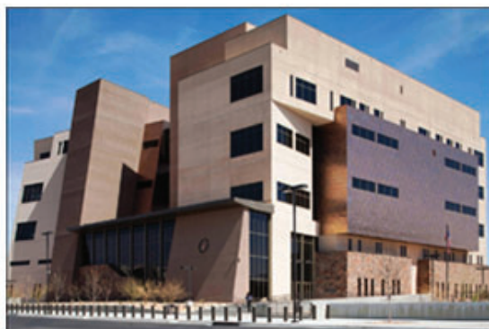
U.S. Courthouse, Las Cruces