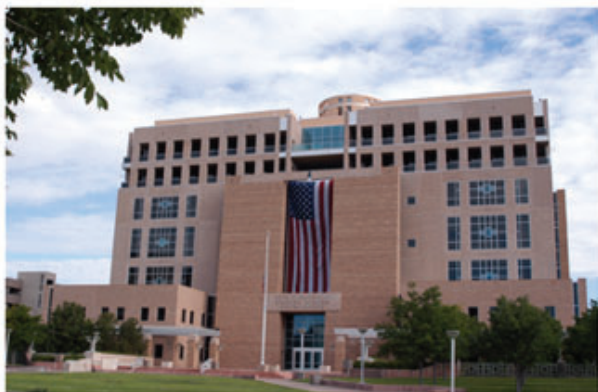
Pete V. Domenici Courthouse, Albuquerque